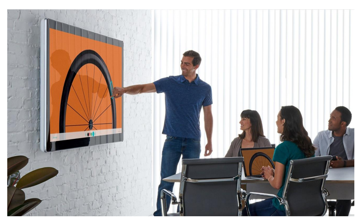
Figure 1. White Boarding Capability on the Cisco Spark Board 70

The Cisco Spark <sup>™</sup> Board is an all-in-one device that provides everything you need to collaborate with your teams in physical meeting rooms. You can wirelessly present, white board, and have video and audio calls. And it securely connects to your virtual teams through the Cisco Spark service, via your Cisco Spark app-enabled devices, so you can take your meetings and content on the road.