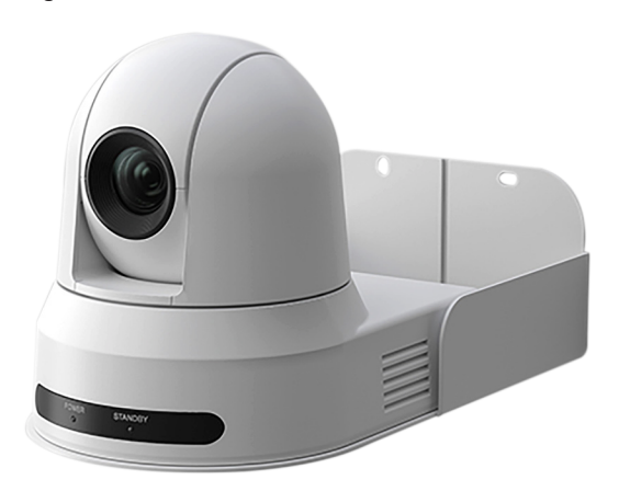
Figure 1. Webex PTZ 4K Camera