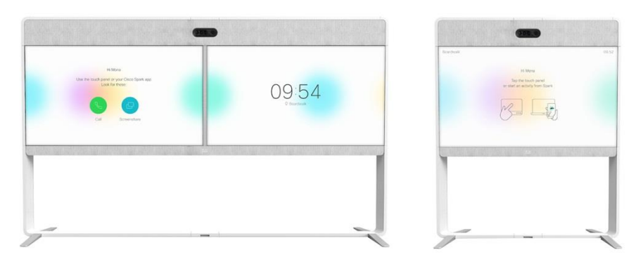
Figure 1. Cisco Webex Room 70 Dual and Cisco Webex Room 70 Single on Free-standing Floor Stand

<sup>*</sup> Integrated microphones for speaker tracking only